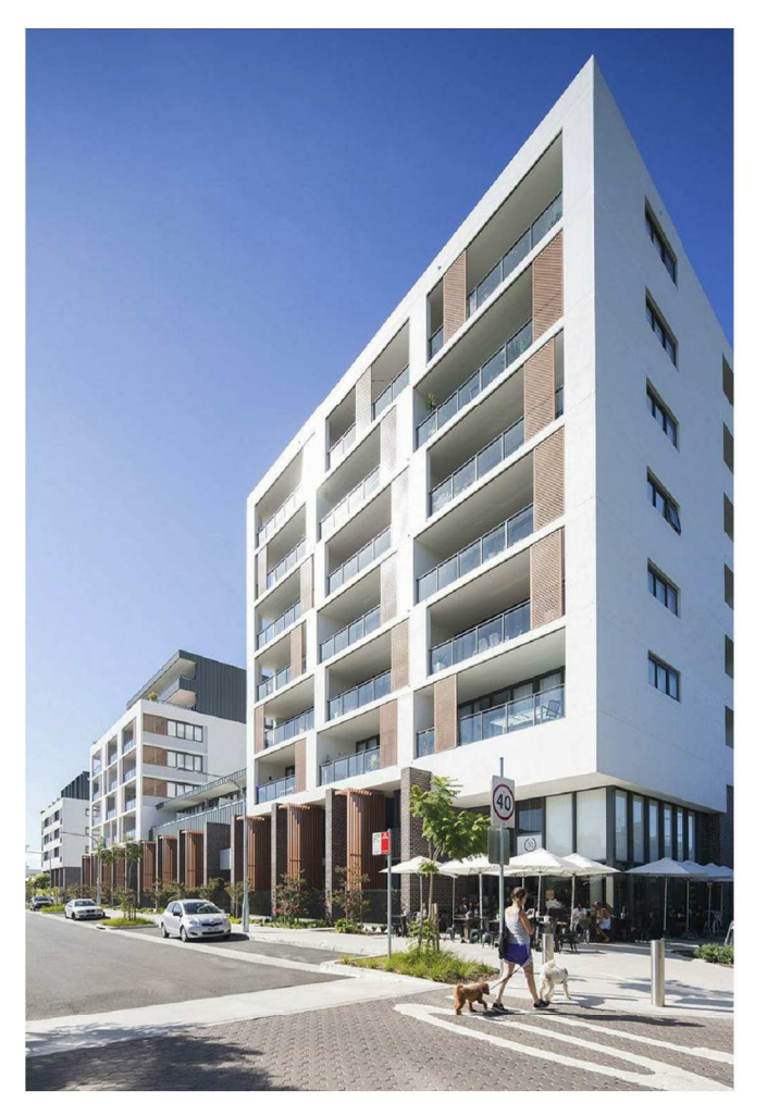
3 PROPOSED RED BRICKWORK FACADE